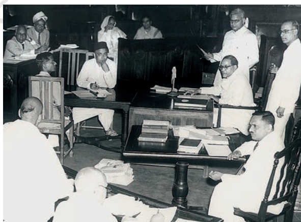
Dr. B.R. Ambedkar presiding over a discussion in the Constituent Assembly

Dr. B.R. Ambedkar CAD, Vol. VII, p.37, 4 November 1948