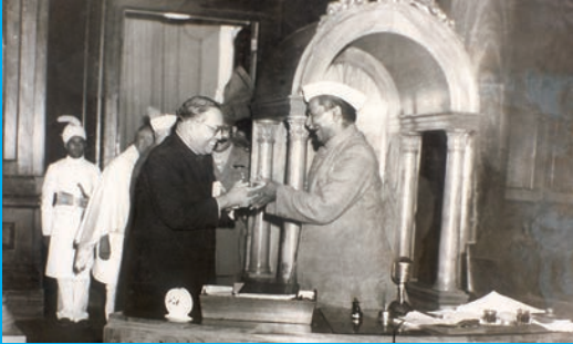
The President of the Constituent Assembly, Dr. Rajendra Prasad and the Chairman of the Drafting Committee, Dr. B.R. Ambedkar greeting each other

Constituent Assembly, where each clause of the Constitution was subjected to scrutiny and debate, is a tribute to public reason at its best. These debates deserved to be memorialised as one of the most significant chapters in the history of constitution making, equal in importance to the French and American revolutions.